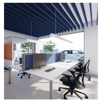
Hot desks for remote working

Bring your ideas to life with the assistance of our in-house digital experts.